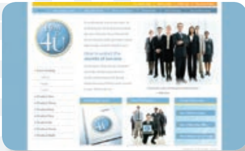
Example website powered by Mountain Commerce

If you already have a website and don't need graphical services, our skilled developers can integrate your existing online storefront into Mountain Commerce 6. Graphic design, product information, and more can be imported. Fees vary; please call (877) 583-0300 for more details.