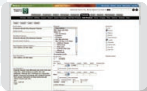
Example of Administrative Tools