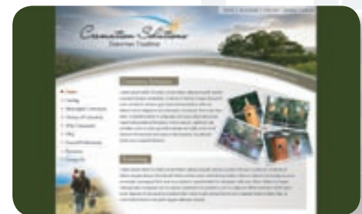
Example website powered by Mountain Commerce