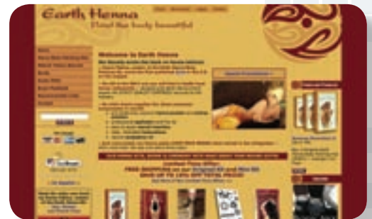
Example website powered by Mountain Commerce