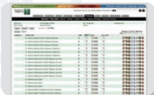
Example of Administrative Tools

Sales tax, when applicable, is automatically added into an order. Mountain Commerce maintains and auto-updates all applicable tax tables for every county in the US. Any customer can be designated as tax-exempt, and any product can be listed as taxable vs. nontaxable.