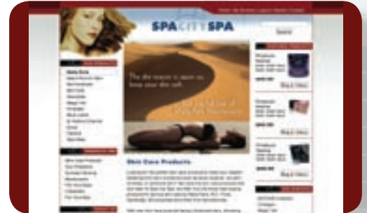
Example website powered by Mountain Commerce

If you already have a website you like, that's not a problem! Mountain Media's designers can capture your site's design and seamlessly integrate it within Mountain Commerce.