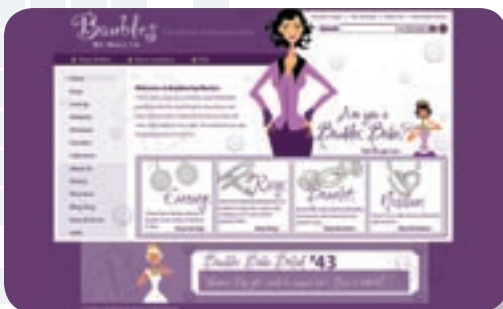
Example website powered by Mountain Commerce