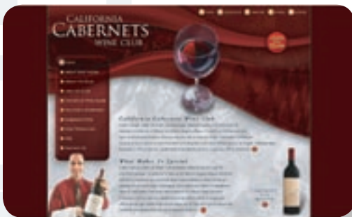
Example website powered by Mountain Commerce