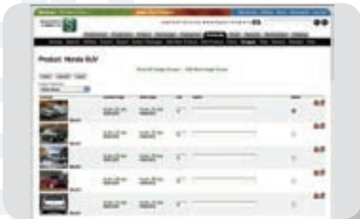
Example of Administrative Tools

And customer orders are easily managed through Mountain Commerce's comprehensive order fulfillment system, featuring many essential functions: